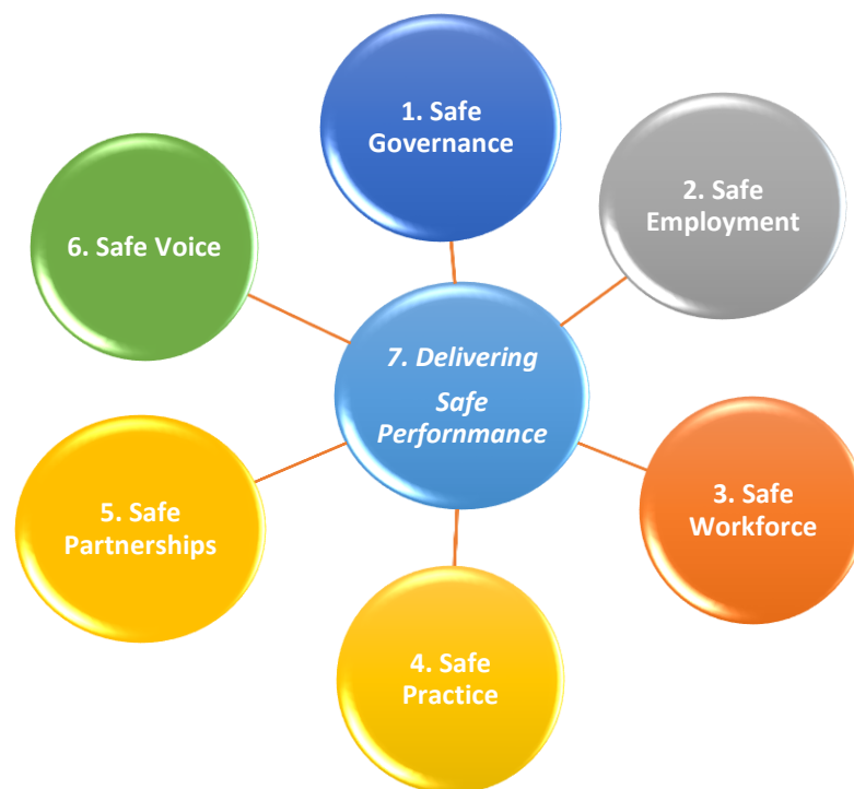
Figure 1 Swansea Model

“Doing nothing is not an option – Spot it, Report it!”